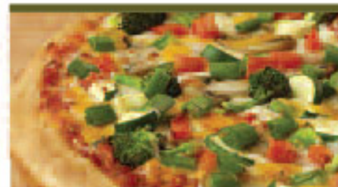
Heart Smart Vegetarian

Say Cheese Mozzarella, cheddar, feta & parmigiana